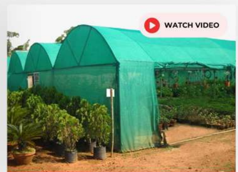
FAN AND PAD POLY HOUSES